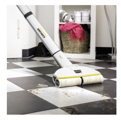
Removes spills and dried on liquid.