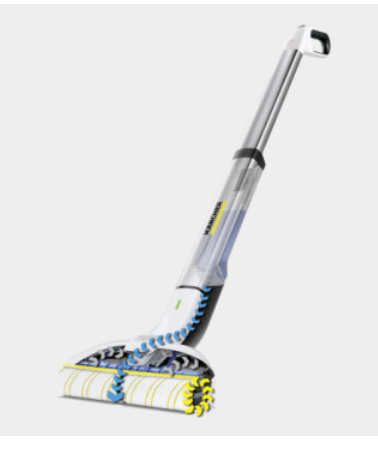
Wiping is 20 per cent* cleaner than with a mop and much more convenient